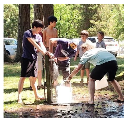
Unexpected excitement to this year's picnic.