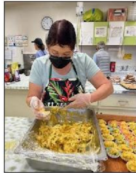
BWA Bento Fundraiser